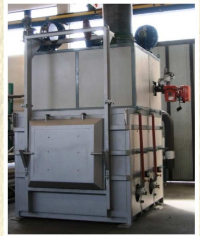
FIXED - HEARTH FURNACE COMPLETO OF AFTER-BURNERS

LEADING ITALIAN AND INTERNATIONAL COMPANIES WORKING IN THE FIELDS OF AERONAUTICS, ENERGY, ORTHOPAEDICS AND ART WORK SPECIFY SOLAR IMPIANTI FURNACES FOR THEIR FUTURE DEVELOPMENTS.