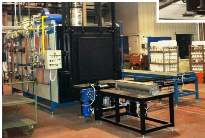
PREHEATING PUSHER TUNNEL FURNACE