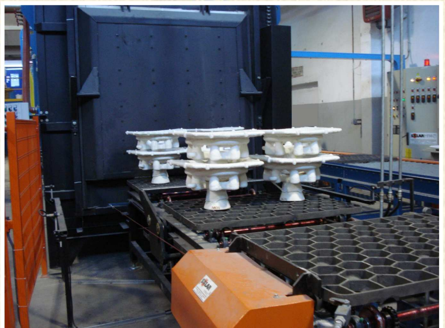
SHELLS ON REFRACTORY STEEL PLATES

SOLAR IMPIANTI FORMI DI PREHEATING FURNACE CASTING FC